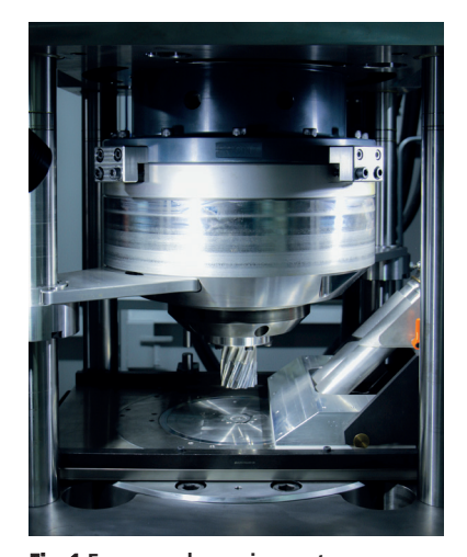
Fig. 1 E-powered pressing system SVZe300