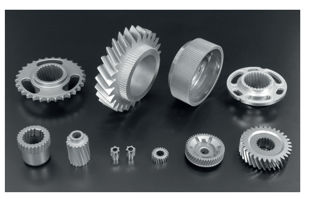
Fig. 3 Samples of helical gear parts